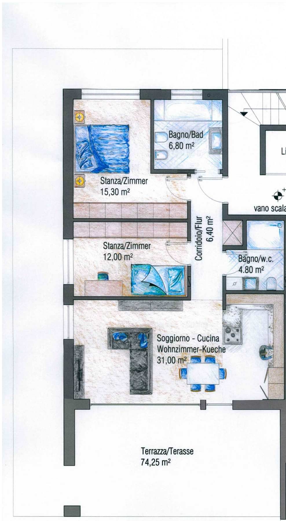
PIANO TERRA | ERDGESCHOSS quota ±0.00